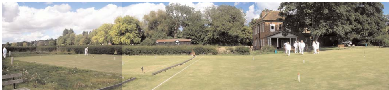
The two lawns and Bassetsbury Manor House was the lovely venue for our first away friendly with High Wycombe Croquet Club.