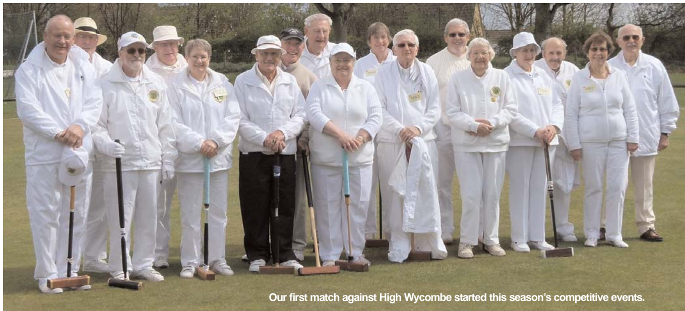
Our first match against High Wycombe started this season's competitive events.